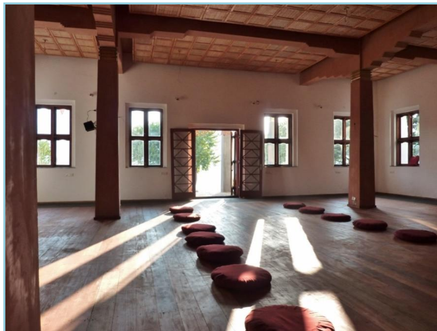
Conference/ lecture. multipurpose

Tarab Ling invites organizations and institutions to organize teachings, conferences, yoga, retreats, and contemplations on its campus.