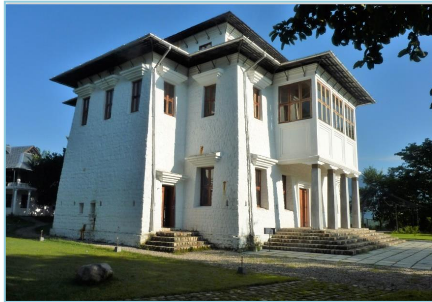
Main teaching building