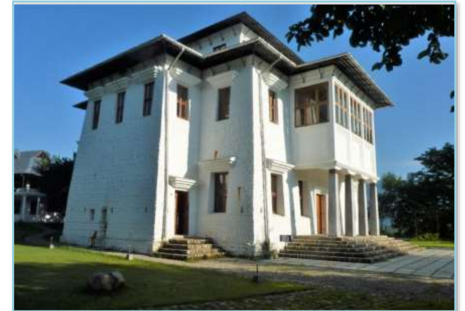
Main teaching building

Tarab Ling is situated in an area of reserve forest at the fringe of Asthal village overlooking the Baldi River 50 meters below and with the Himalayan foothills in front. From New Delhi it is easy to reach Tarab Ling as it is not far from the capital of the state of Uttarakhand.